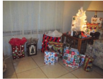
Heritage Bible Church gave our children a wonderful Christmas a few weeks late.