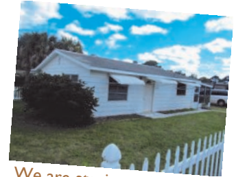
We are staying at FEA Ministries "missionary house" at Hobe Sound.