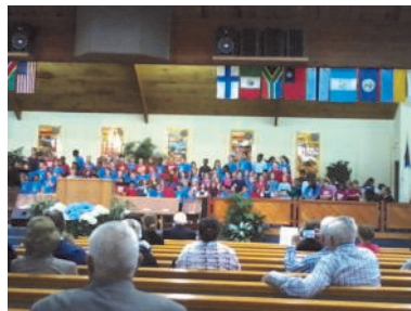
The girls really enjoyed the children's services at Sea Breeze Camp!