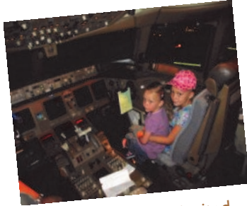
One of the pilots invited our girls to the cockpit before takeoff.

After more than twenty hours in the air, we arrived safely in America on the 23rd of January. It was quite shocking to go from 90F in Africa to 17F in New York City! Overall the trip went well.