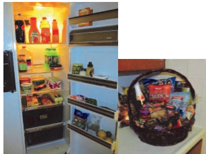
Hope International Missions and our family and friends stocked our cupboards and fridge before we arrived.