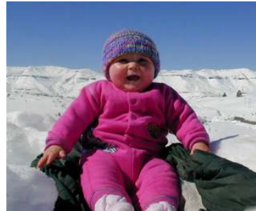
Fun in the snow