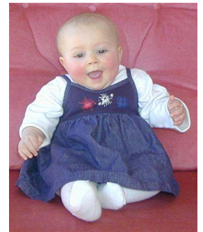
Fourth of July